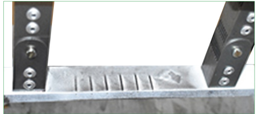
Test Result in DC