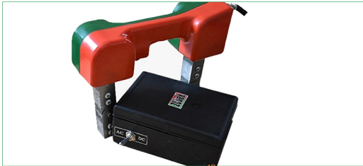
DC Covertable ZC-9D